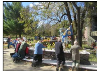
Pilgrims Praying at the Sacred Spot