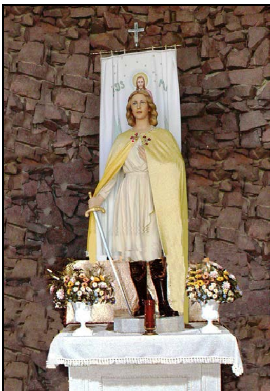
Saint Joan of Arc Deliverer of France