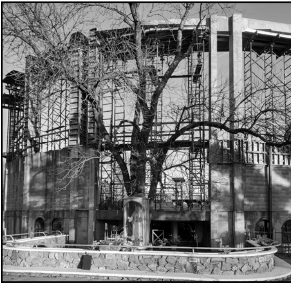
House of Prayer South End Looking North

Today the Poor Clares number over 20,000 sisters throughout the World, with 16 Federations in over 70 Countries.