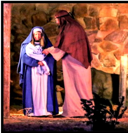
Jesus' Birth in the Stable Cave