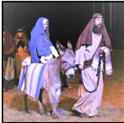
Journeying to Bethlehem"

If you would like a Video to help encourage others to come on the First Saturday in December at 7:00 P.M., please contact us and we will arrange to help meet your needs. God bless you're efforts!