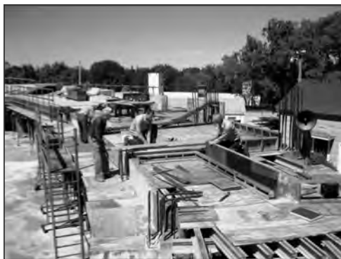
Setting Up Shoring and Forming for the Fifth Pour

Our Saturday Work Bees begin at 9:00 A.M. These Saturday volunteers are always pleased with the special treat prepared by the women; as a noon lunch is offered to the men, so they can continue to work in the afternoon without having to leave for lunch on their own. May God and His Holy Mother bless the cooks; and all those volunteers traveling to help with the House of Prayer and the other projects on the Shrine Grounds.