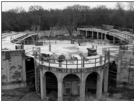
Mezzanine Floor (Choir Loft) and Front Entrance

When this project is completed we will have a beautiful building to worship our Lord in. Please pray that we continue to receive the funds and support needed to complete this project as requested by Our Blessed Mother.