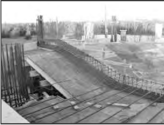
PLACING FORMS AND REBAR