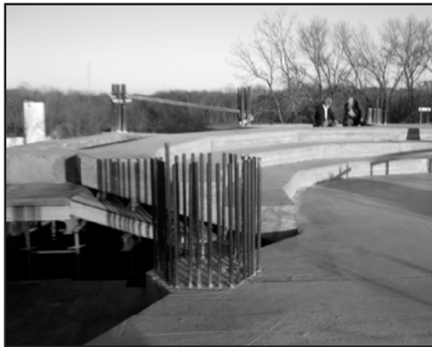
FOURTH CONCRETE POUR IS COMPLETED