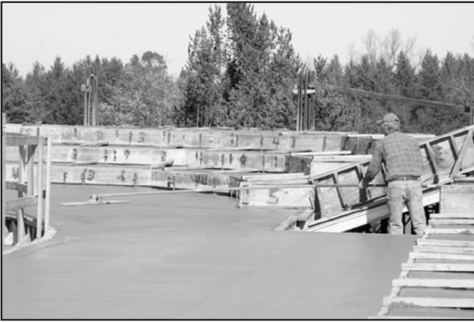
FINISHING THE SURFACE OF CONCRETE AREA