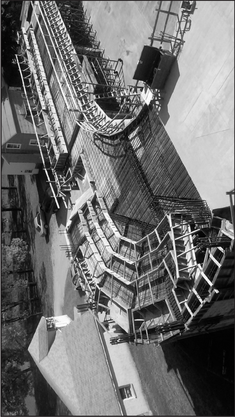
HOUSE OF PRAYER MEZZANINE (CHOIR LOFT) REINFORCING IN PLACE FOR THE FOURTH POUR OF CONCRETE