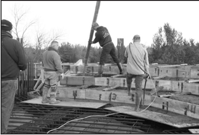
FOURTH CONCRETE POUR OF THE MEZZANINE AREA